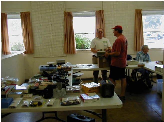
K9FOH (l) & WD9JLN (r)