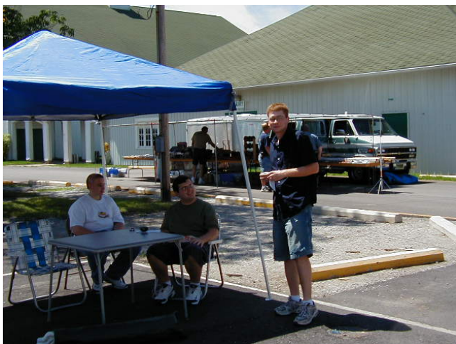
KB9RAM (l) & KC9CYK (c)