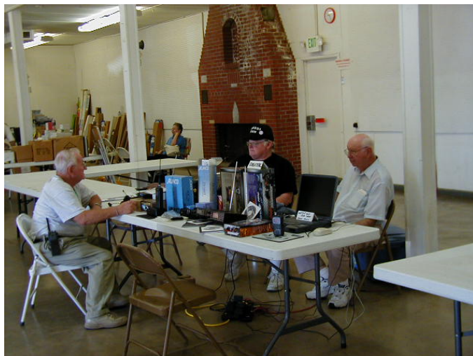
WB9VAL (l) & K9SKI (C)