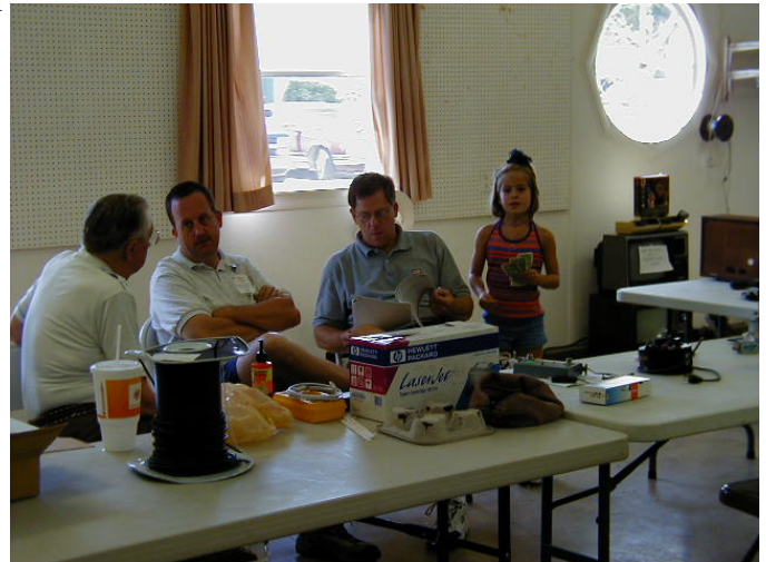
(Continued on page 3)

for the community fund raising event. The club helps by providing emergency and coordinating communications throughout the 100 mile course which includes remote and low-lying terrain. Club volunteers will use 2-meter, including the WIRES repeater, during the event. If you are interested