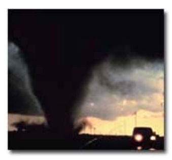
Texas 1995 (http://noaa.gov)

When reporting storm information, the most important aspects are the time of the report, what you see and where you are located. If you haven't attended a storm spotter class in a while, take advantage at your earliest opportunity.